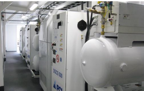
O<sub>2</sub> generators inside the gas handling building