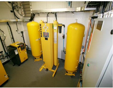
Dessicant oxygen driers and compressors